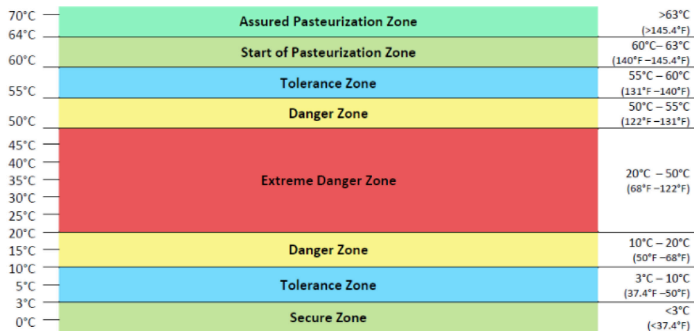
Figure 1. Sous Vide Temperature of Safety Zone