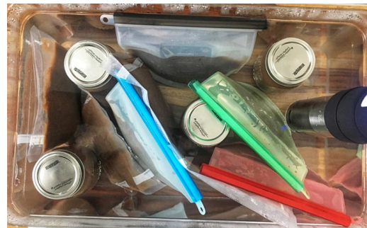
Figure 8. Arrangement of mediums in hot water bath in first run

in the middle of the glass medium to acquire an accurate reading. This was done with cheese cloth wrapped around the SmartButton, suspended by string. The string was attached to the lid of the mason jar with a glue gun. All mediums were transferred into the cooler to ensure that they were at the same temperature before the start of the experiment. Once the sous vide reached 56.5°C, four of each medium was added to the hot water bath. The mediums were arranged randomly in the hot water bath spaced out from each medium and submerged (Figure 8). An important note is not to block the immersion circulator, this may reduce its effectiveness to disperse the heat in the water bath. After 150 minutes, all the mediums were removed. This procedure was repeated three more times. A total of eighteen runs were conducted with each medium, with two of those runs being conducted in the pilot study.