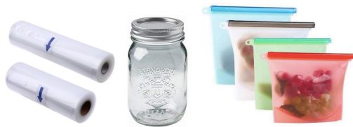
Figure 5. Mediums: FoodSaver Polyethylene Plastic Sous Vide Bags, 500 mL Bernardin Glass Jars and Two-Piece Snap Back Lids, and Kepeak Reusable Silicone Food Storage Bags (27)( 28)(29)

The thermocouple thermometer used to calibrate the immersion circulator and ACR SmartButtons was the brand Digi-Sense DuaLogR. This thermometer was calibrated through ice bath and hot water bath to ensure measurements were accurate within \pm 1^{\circ}\text{C} increments.