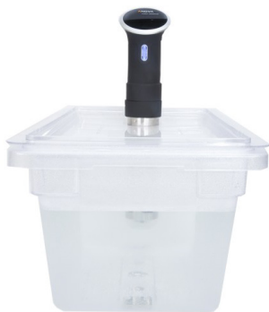
Figure 2. 18 Liter Polycarbonate Container with Custom Cut lid (24)

The brand of immersion circulator used for sous vide cooking was the Anova Precision Cooker. The study procedure involved the immersion circulator being clamped to a sous vide container filled with 16 L of water and set to 56.5°C, according to the manufacturer's manual. A thermocouple probe was submerged into the water to ensure that the Anova Precision Cooker heated the water bath to 56.5°C to ensure precision.