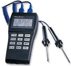
Figure 4. Digi-Sense Thermocouple (26)

The thermocouple thermometer used to calibrate the immersion circulator and ACR SmartButtons was the brand Digi-Sense DuaLogR. This thermometer was calibrated through ice bath and hot water bath to ensure measurements were accurate within \pm 1^{\circ}\text{C} increments.