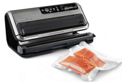
Figure 6. FoodSaver FM5400 2-in-1 (31)

including as an alternative to plastic sous vide bags (30). With the use of food grade silicone, there are no harmful byproducts or chemicals (30). The glass medium that was used was the 500 mL Bernardin jars and two-piece snap lids (27). Silicone and glass were tested because they provide an environmentally friendly alternative to polyethylene bags for sous vide cooking.