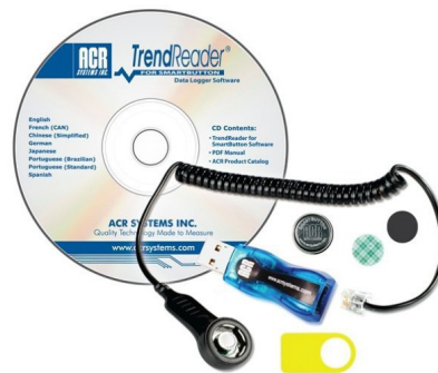
Figure 3. ACR Smart Buttons, Accessories, and TrendReader Software (25)

ACR SmartButtons data loggers were used to examine the temperature of gravy sauce within each medium. Trend Reader software was installed onto a personal laptop according to the manual. The SmartButtons were programmed using the software. For calibration, SmartButtons were immersed into ice bath and into a hot water bath measured at 56.5°C with a calibrated thermocouple. The data readings of the thermocouple and SmartButtons were compared to ensure that temperatures were within \pm 1^\circ\text{C} of each other. Each SmartButton was programmed 15 minutes