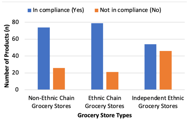
Figure 3. Number of products in compliance with current labelling provisions in Canada among different grocery store types.

food products from non-ethnic chain grocery stores, which yielded 74.0% (n=74) of food products in compliance with the new labelling provisions, whereas 26.0% (n=26) were not in compliance. From ethnic chain grocery stores, 79.0% (n=79) of food products were in compliance with the new labelling provisions, whereas 21.0% (n=21) were not in compliance. As for independent ethnic grocery stores, 54.0% (n=54) of food products were in compliance with the new labelling provisions, whereas 46.0% (n=46) were not in compliance. Results are represented in Figure 3 below.