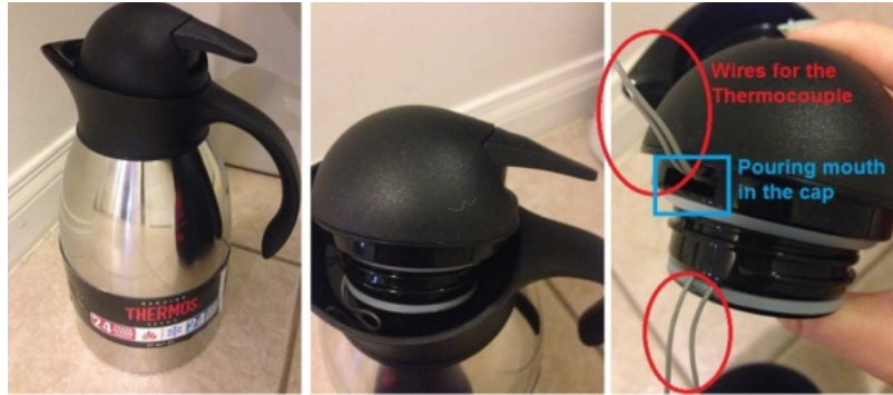
Figure 3. Set-up of the thermal container

A probe thermometer was used to measure the initial temperature of the milk to ensure that it was within 3.1°C – 3.4°C. If the temperature did not achieve the ideal range, the milk was placed back into the refrigerator until the ideal temperature was achieved. After the ideal temperature was achieved, an appropriate amount of milk (1.5L or 0.75L) was measured using the Pyrex® two liter beaker. The thermal container was rinsed with cold tap water and the milk was transferred in subsequently.